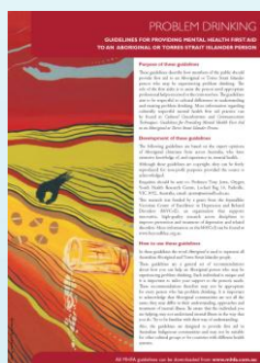
BL/0551 Indigenous Mental Health First Aid – Problem Drinking