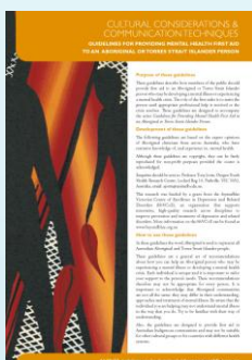
BL/0552 Indigenous Mental Health First Aid – Cultural Considerations and Communication Techniques