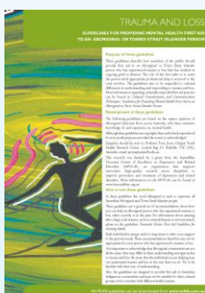
BL/0550 Indigenous Mental Health First Aid – Trauma and Loss