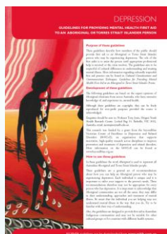
BL/0547 Indigenous Mental Health First Aid – Depression