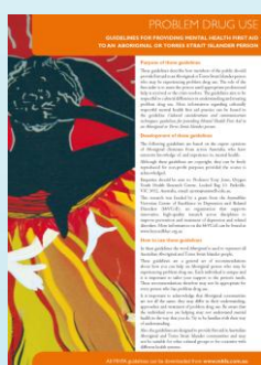
BL/0761 Indigenous Mental Health First Aid – Problem Drug Use