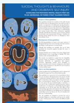
BL/0549 Indigenous Mental Health First Aid – Suicidal Thoughts and Behaviours and Deliberate Self-Injury