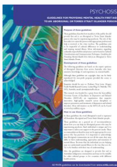
BL/0548 Indigenous Mental Health First Aid – Psychosis